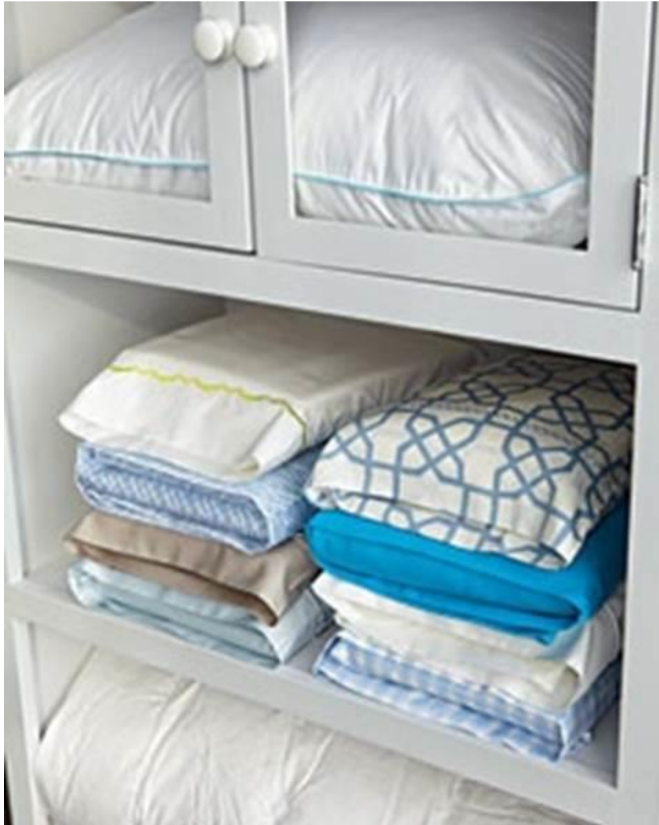
Store bed sheets inside their pillowcases for easy storage and access.