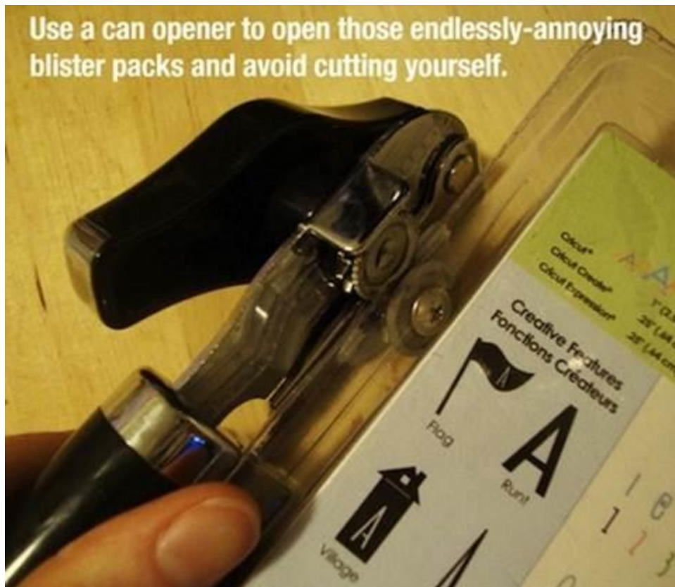
This has to be the simplest way to open those annoying blister packs! TERRIFIC