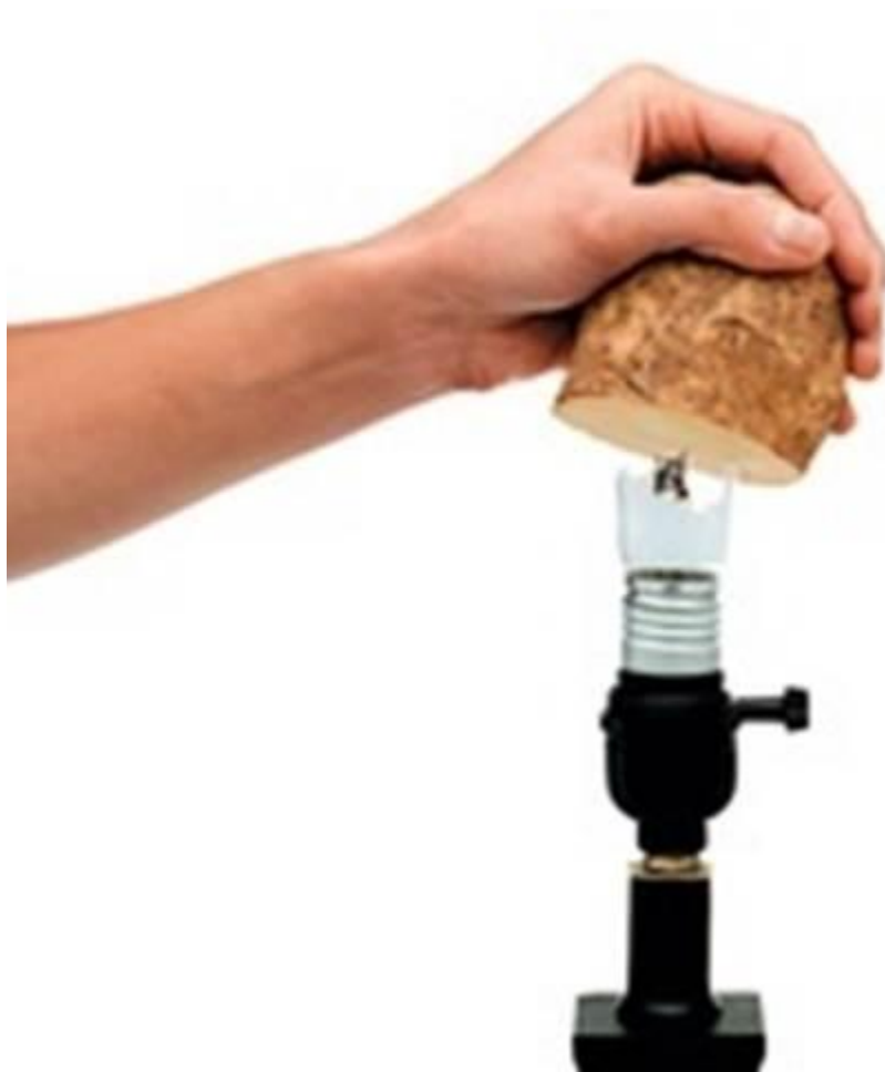
Use a cut potato to easily remove a broken light bulb.