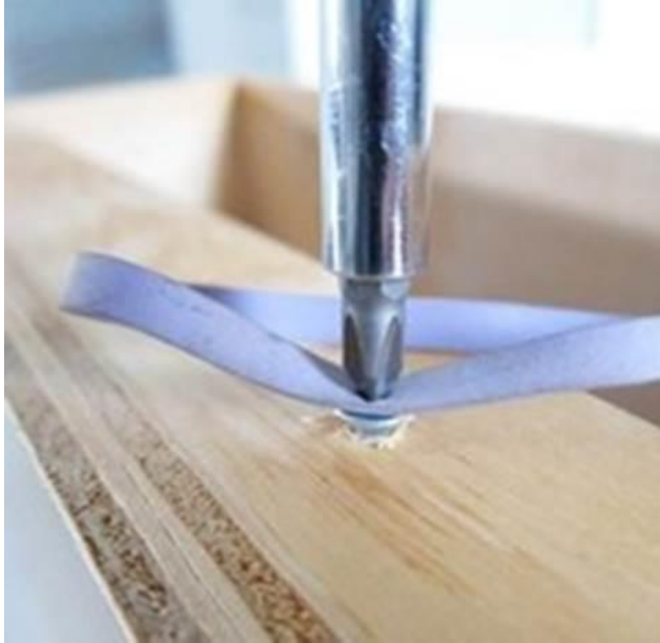
Use a rubber band to rescue a stripped screw.