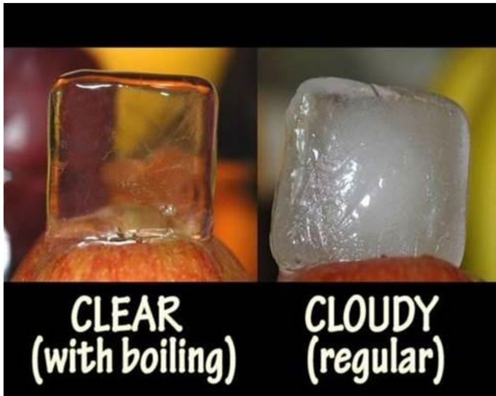
Water straight from the tap becomes cloudy when frozen. To make ice cubes crystal clear, allow a kettle of boiled water to cool slightly and use this to fill your ice cube trays.