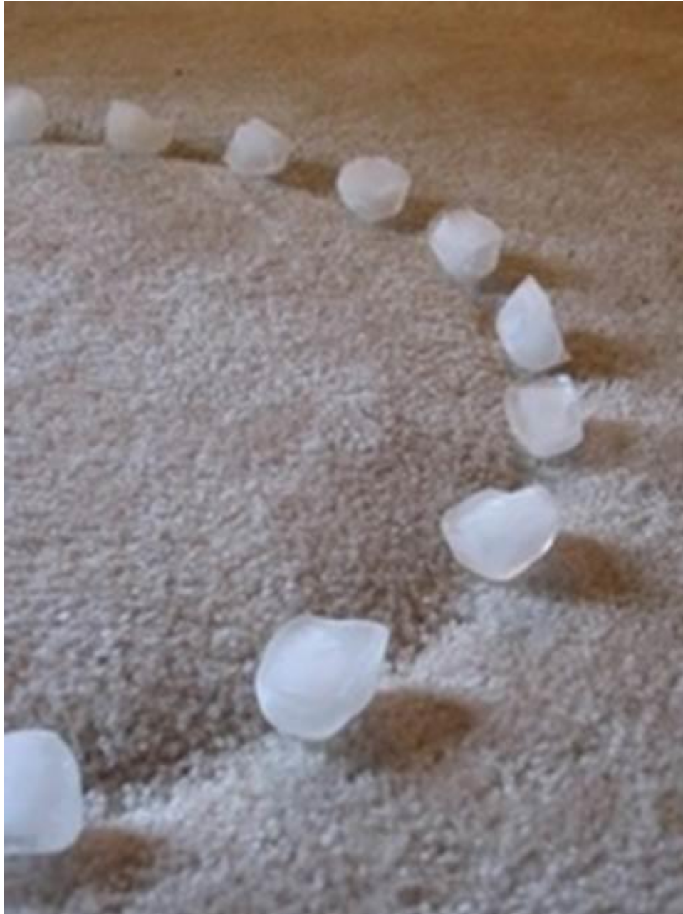
Use ice-cubes to lift out indentations made by furniture on your carpets.