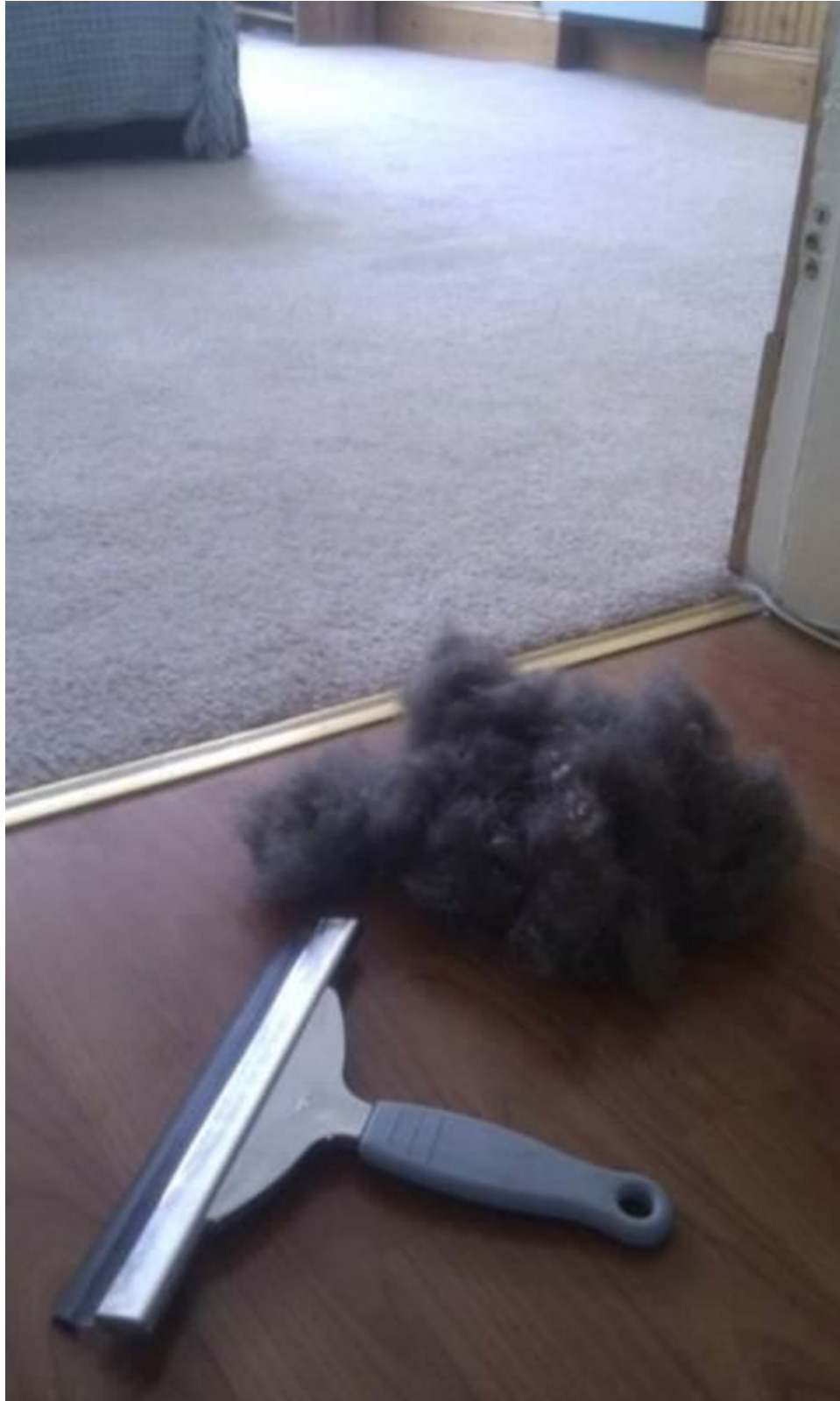
Remove pet hair from furniture and carpets with a squeegee.