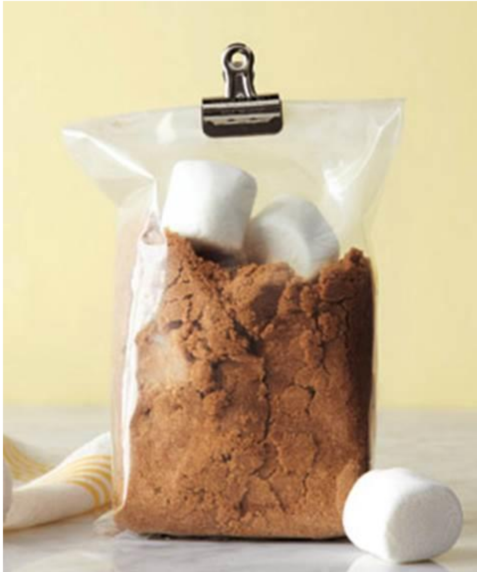
Keep brown sugar soft by storing with a couple of marshmallows.