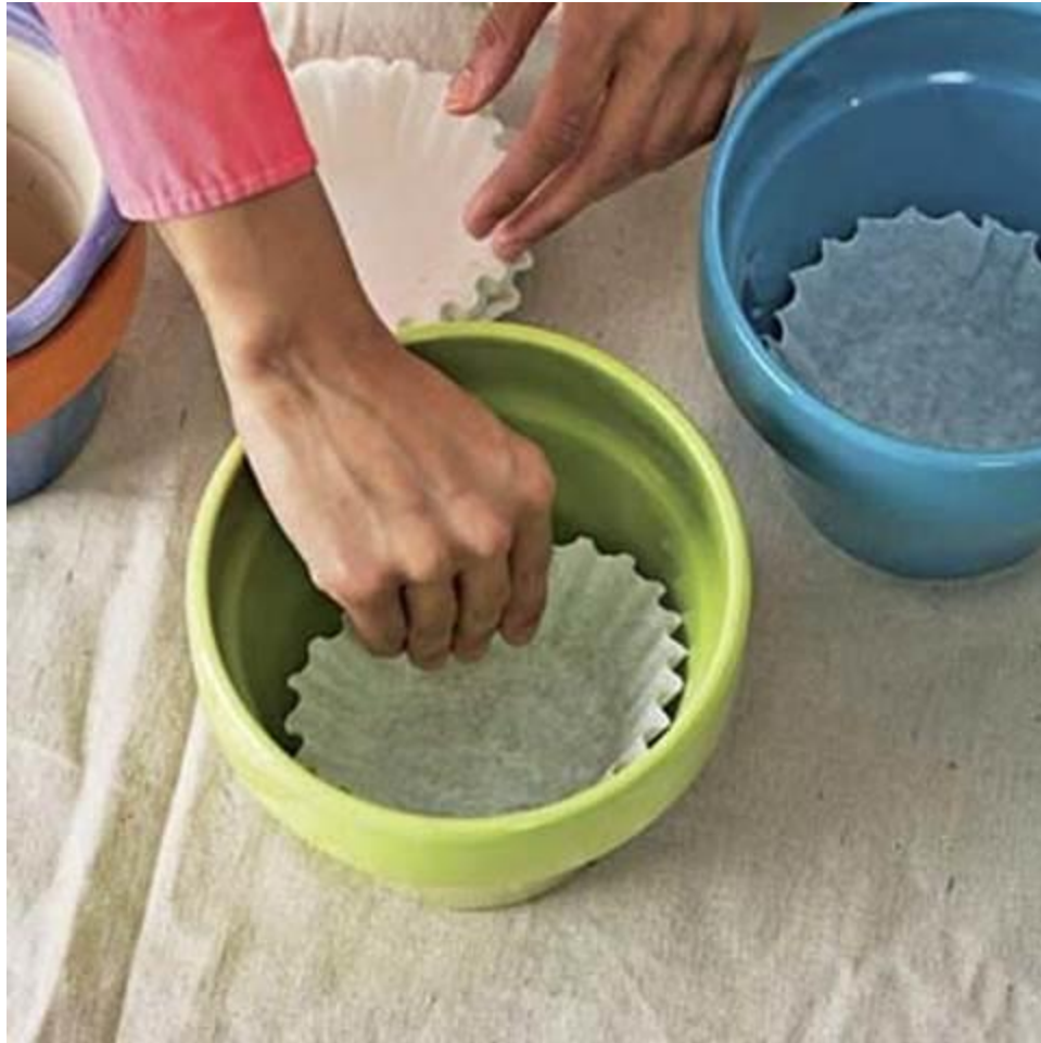
Prevent soil from escaping through the holes in the base of flowerpots by lining with large coffee filters.