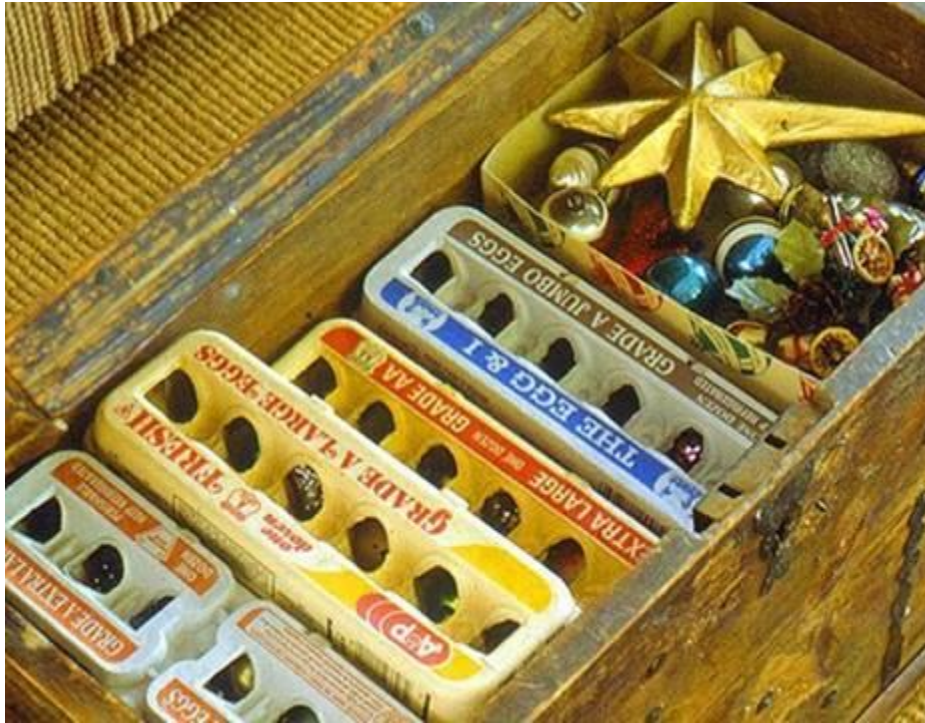
Use egg boxes to store delicate Christmas tree decorations.