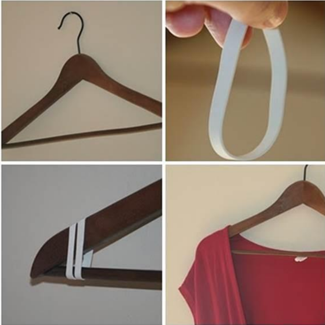
Wrap rubber bands around the ends of a coat hanger to prevent dresses from slipping off.