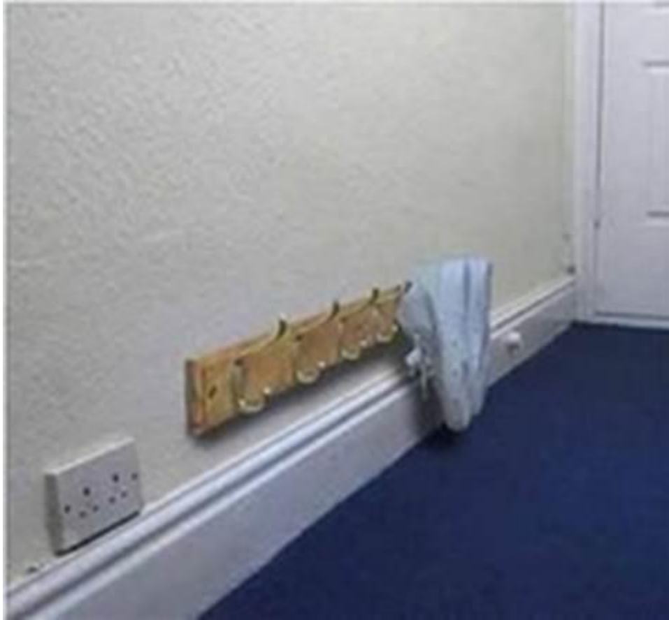
Install a regular coat rack low down the wall to store shoes safely off the floor.