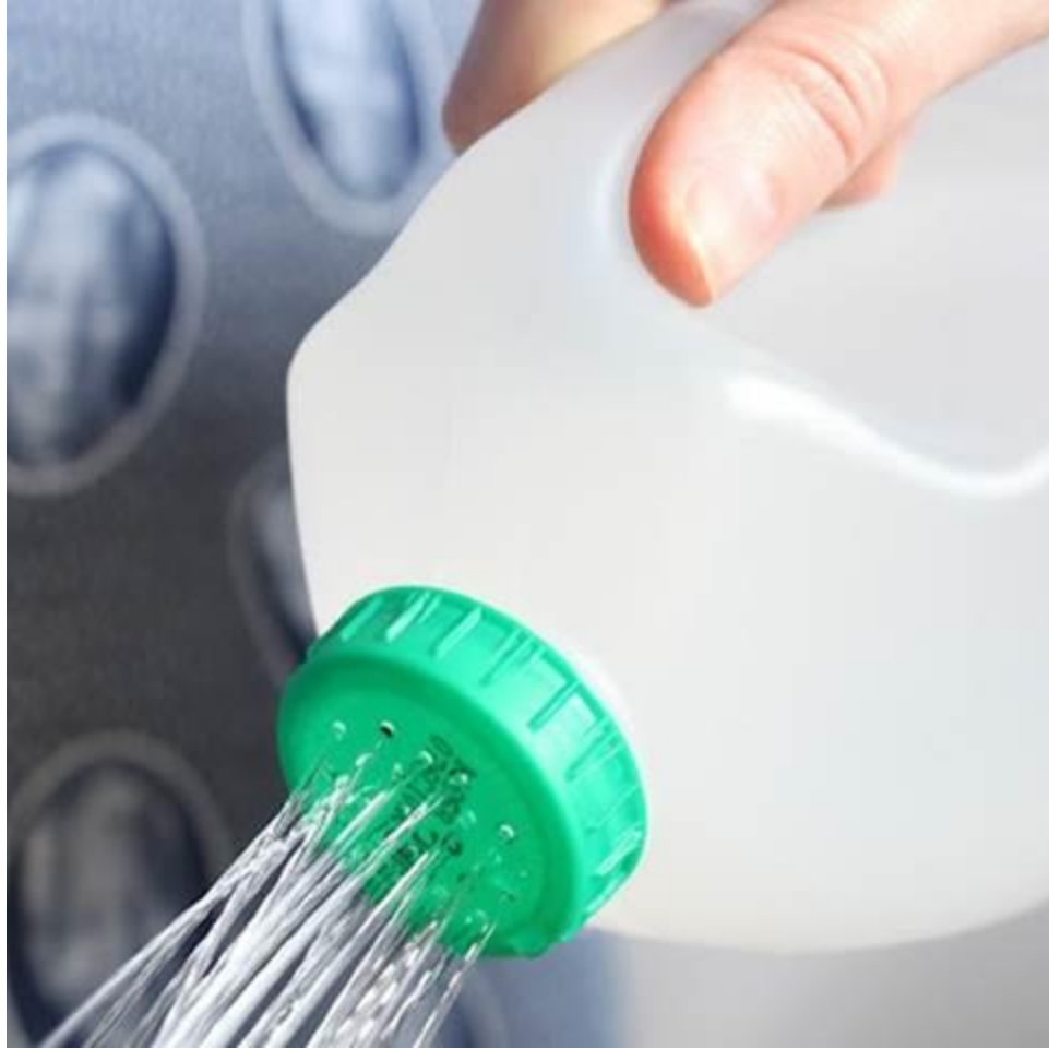
Create a thrifty watering can by puncturing holes in the top of a used milk bottle. GOOD ONE