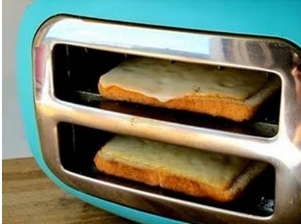
Flip a toaster on its side to make grill cheese. INGENIOUS!!