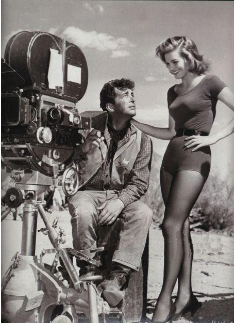
Girl with typewriter and a smoke