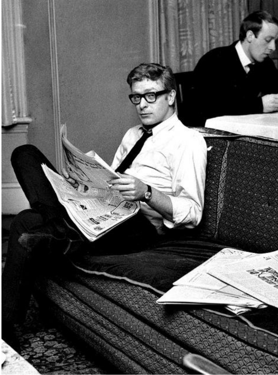
Ernest Hemingway's striking passport photo (1923)