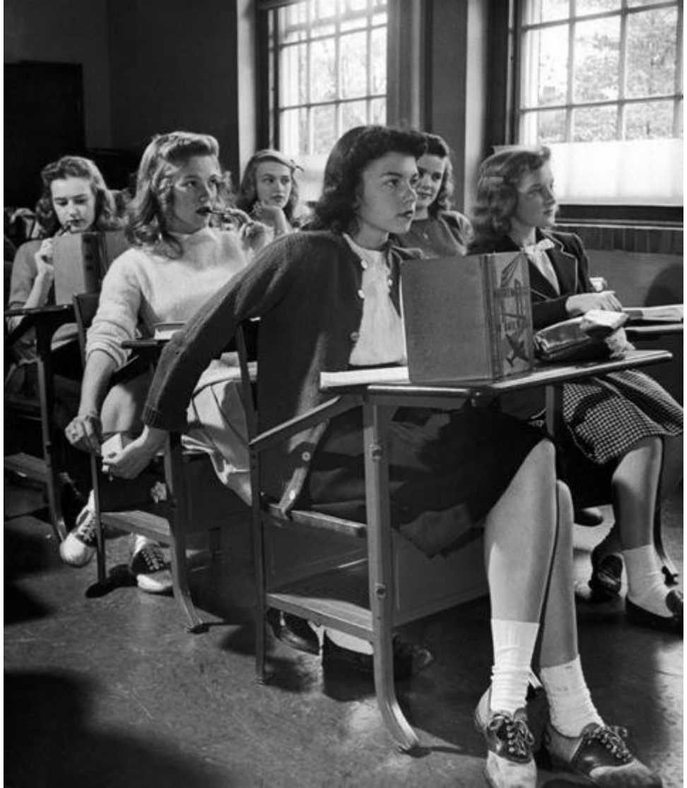
A gang of greasers in NYC, 1950