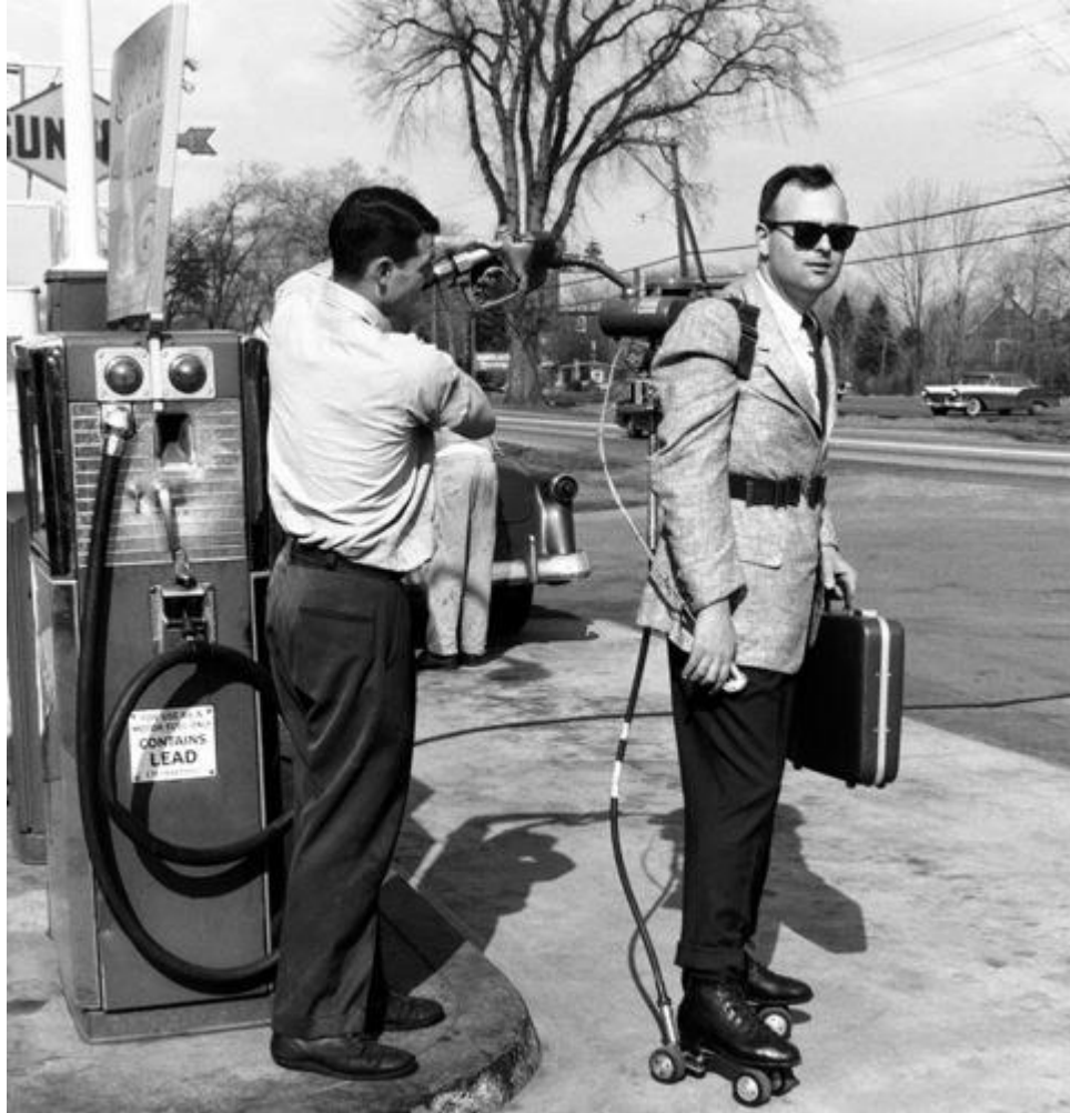
A young Michael Caine in 1959