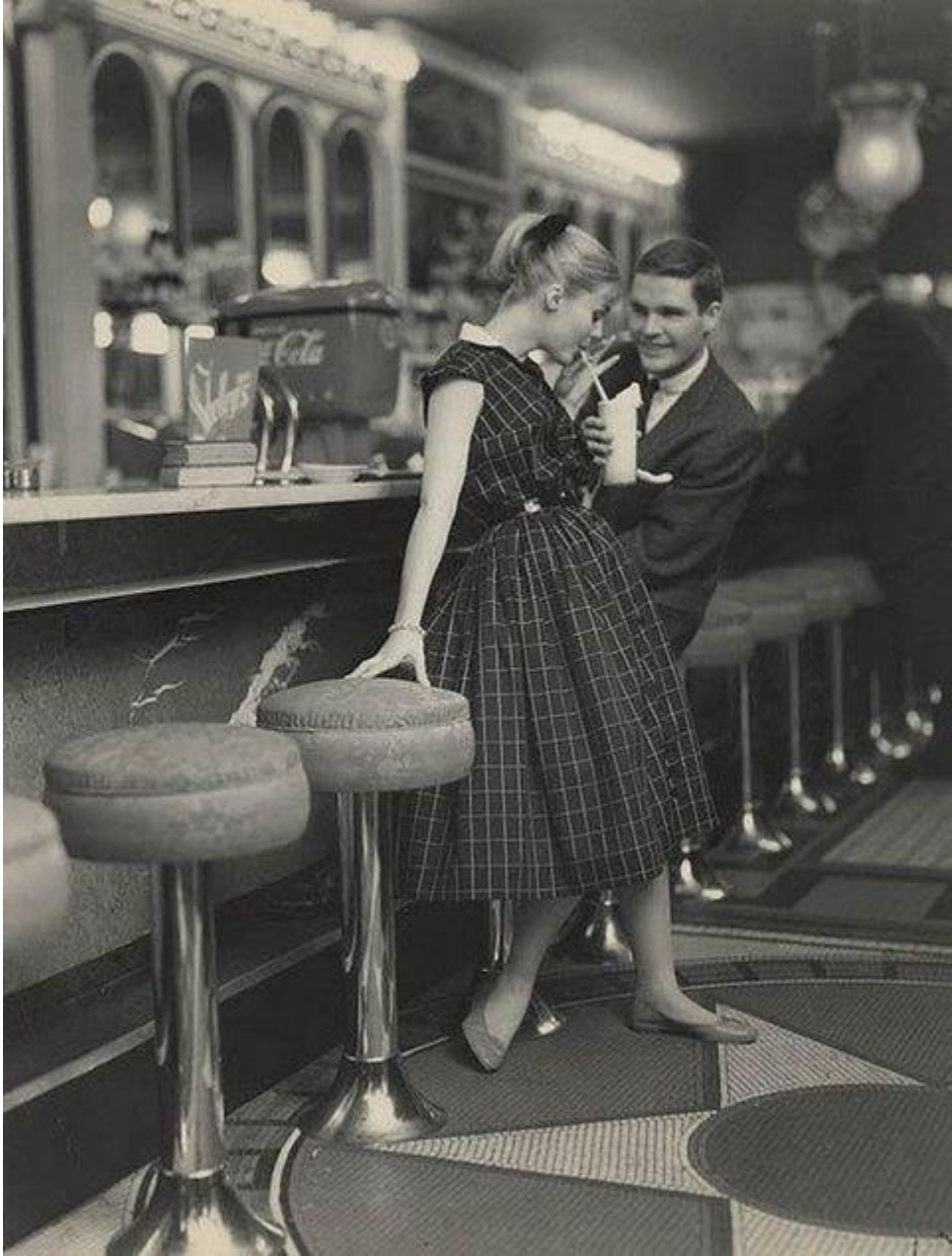
High school fashion feature in Life Magazine (1969)