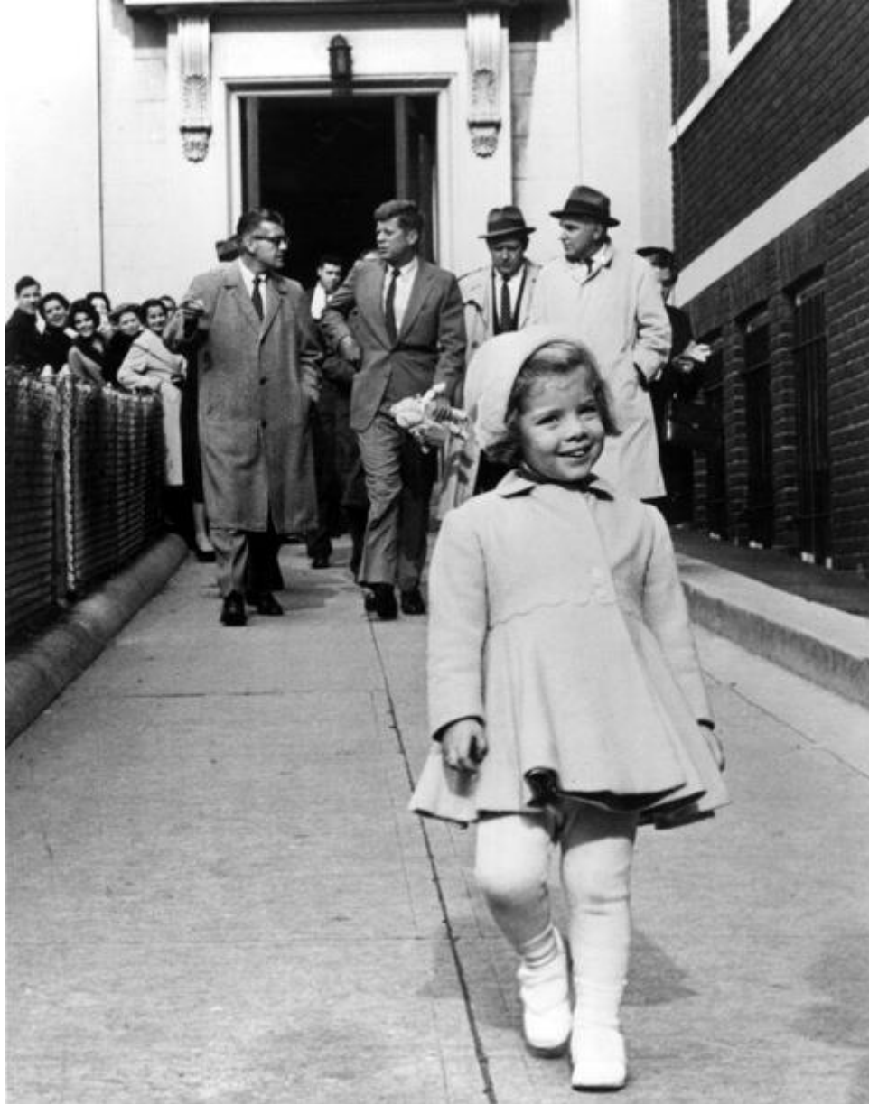
Teenagers and their first car (1950s)