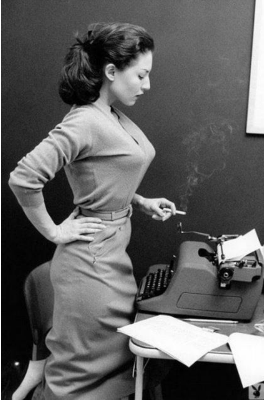
A stylish couple in the rain in London (1963)