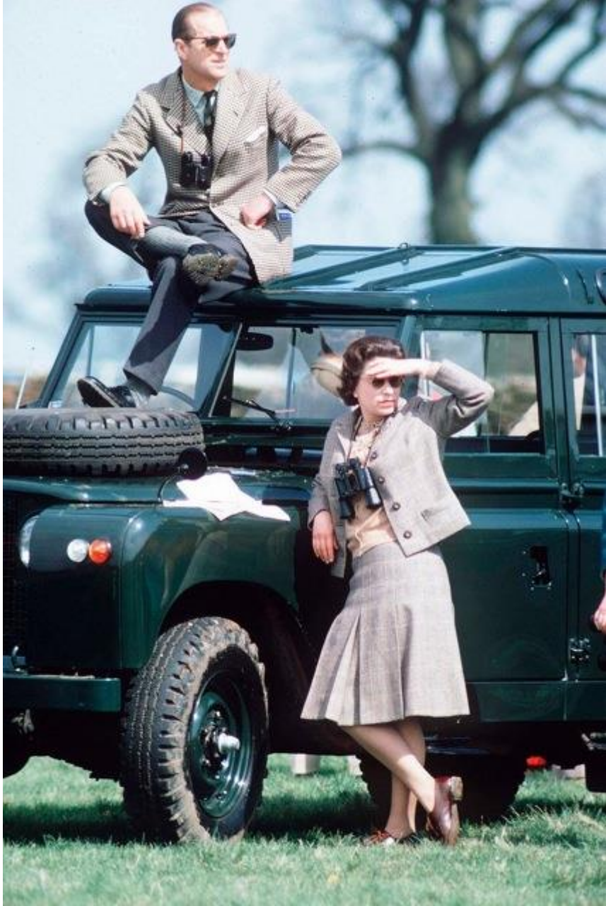
Muhammad Ali looking dapper