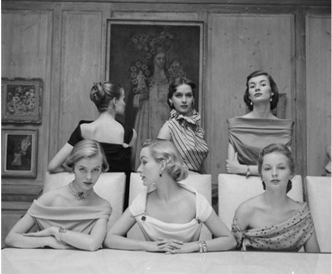
Audrey Hepburn at a premiere on September 14, 1953