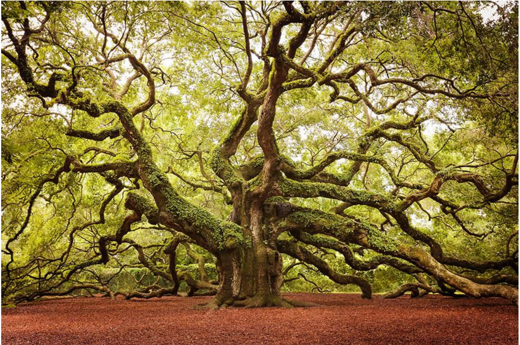
Angel Oak In John's Island In South Carolina

This beautiful tunnel of cherry blossoms blooms in Bonn, Germany in April. To see more tunnels like this one, click here.