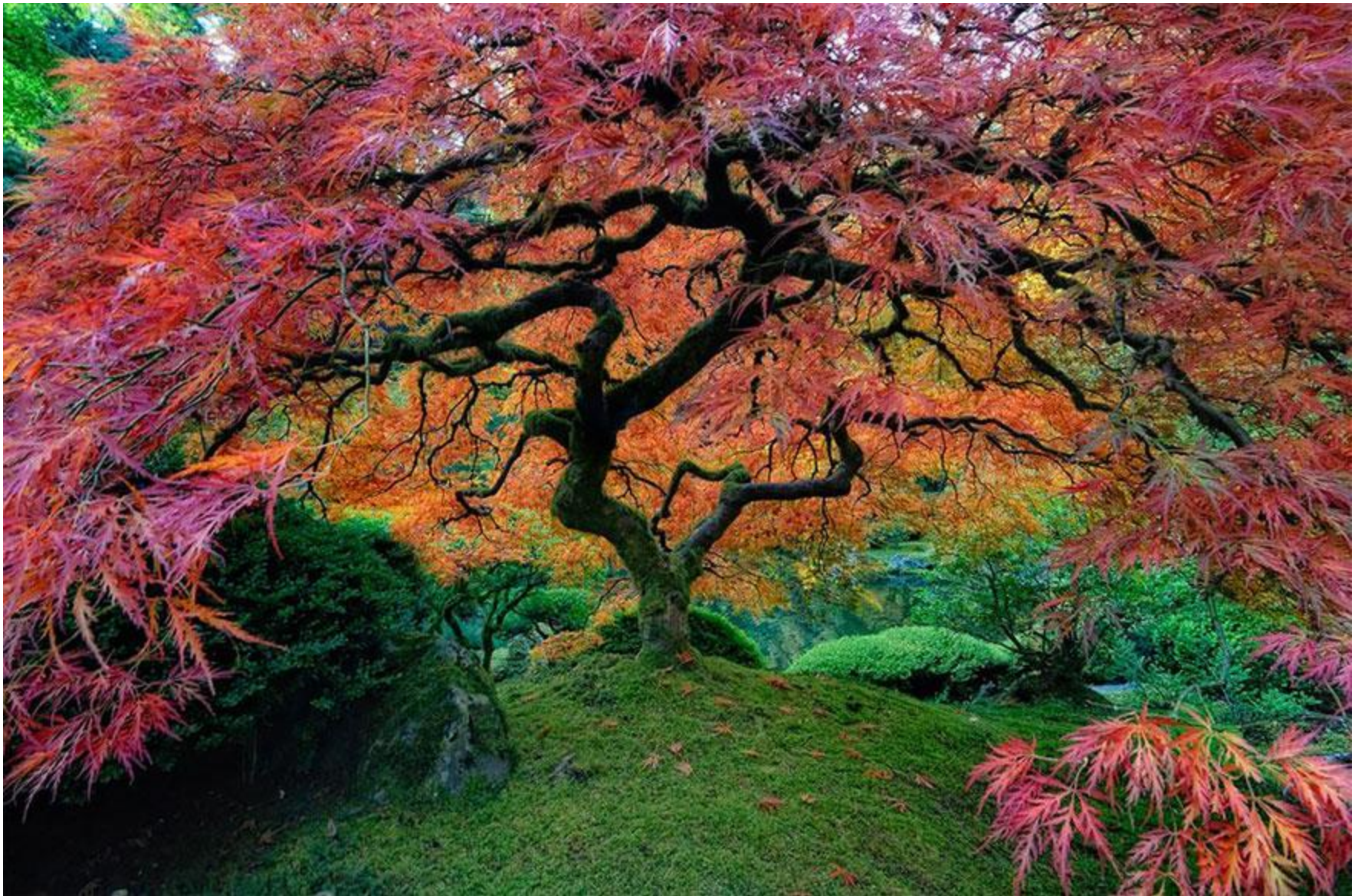
Beautiful Japanese Maple In Portland, Oregon