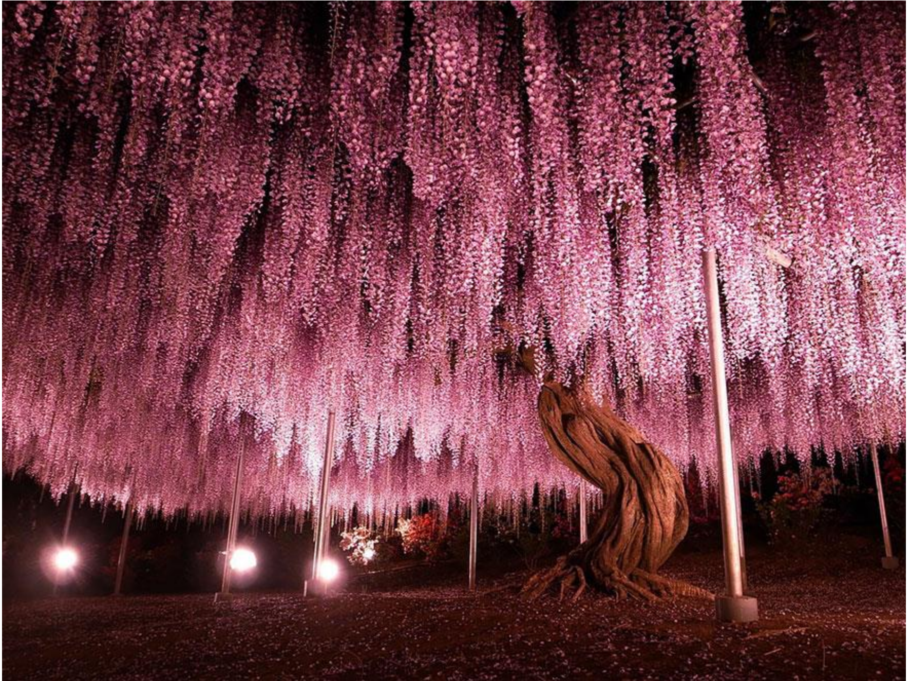
At 1,990 square meters (about half an acre), this huge wisteria is the largest of its kind in Japan. Read more about it here .