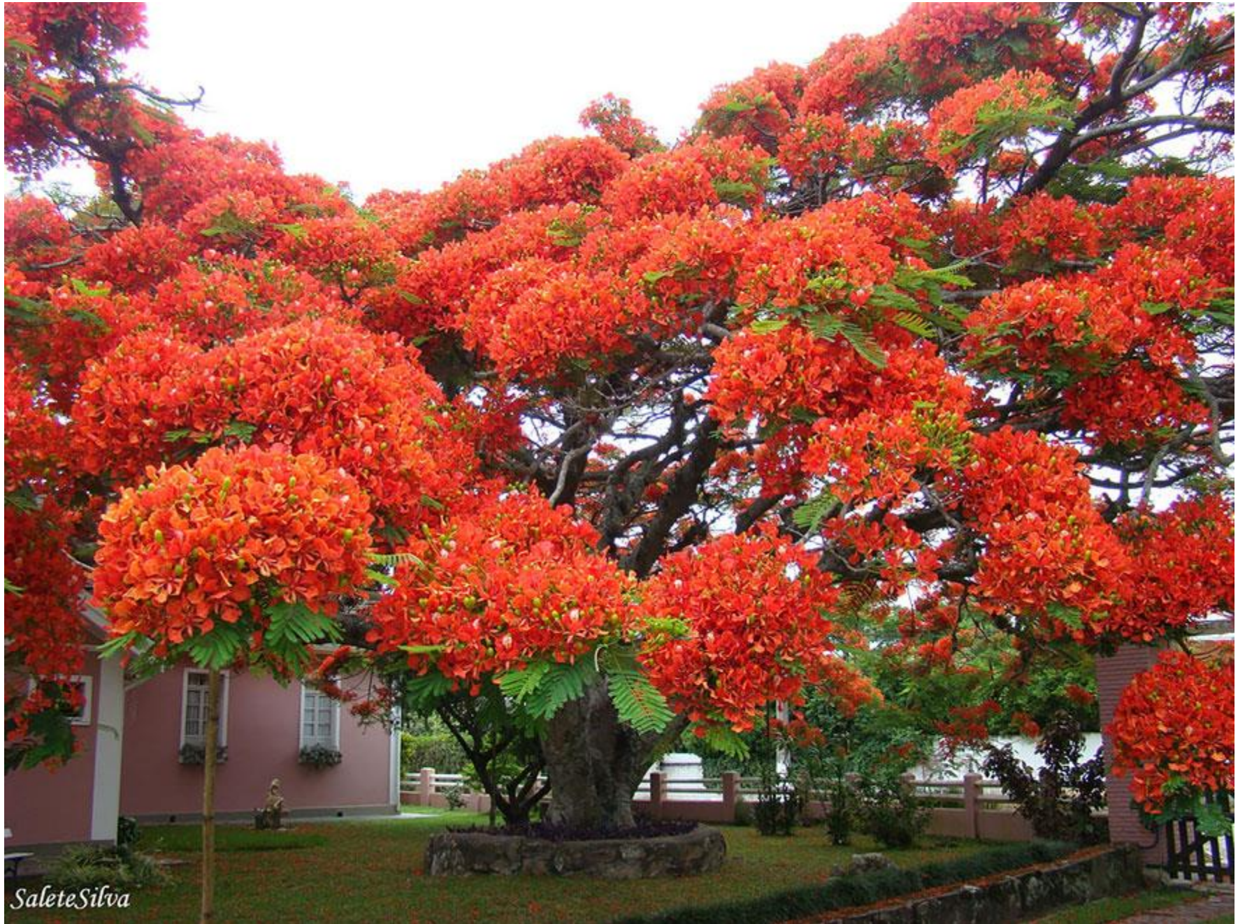
The flamboyant tree is endemic to Madagascar, but it grows in tropical areas around the world.